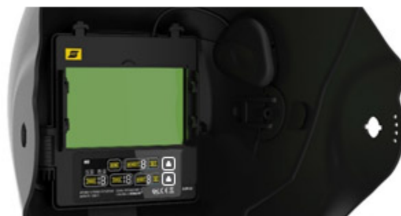
High optical class ADF, with colour touch screen interface