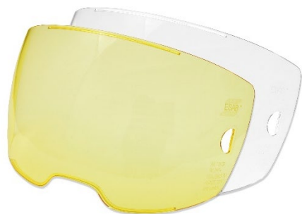
HD Front Cover Lens