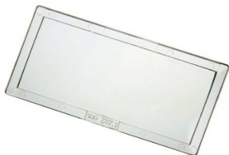
Magnifying Diopter Lens