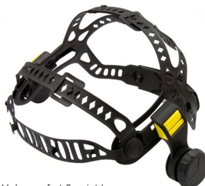
Halo comfort 5 point harness (Front view)