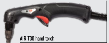
AIR T30 hand torch