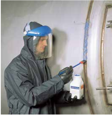
BlueOne™ Pickling Paste 130