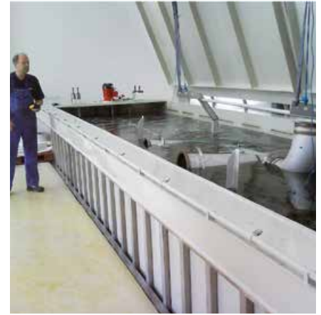
Pickling Bath 302