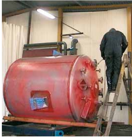
RedOne™ Pickling Spray 240