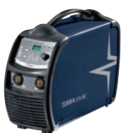
TERRA 270 RC / 350 RC

270 A / 350 A @ 40% 3x400 V 3-270 A / 3-350 A 16,1 kg / 16,5 kg