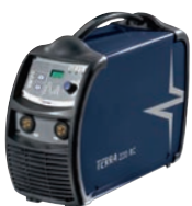
TERRA 220 RC

170 / 220 A @ 35% 1x115 - 230 V 3 - 170 / 220 A 18,8 kg