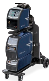
TERRA 400 MSE