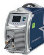
URANOS 2700 PMC

270 A @ 45% 3x230 - 400 V 3 - 270 A 23,0 kg