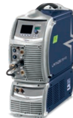
URANOS 2700 MTE

270 A @ 45% 3x230 - 400 V 3 - 270 A 23,5 kg