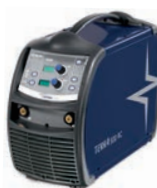
TERRA 500 RC

270 A / 350 A @ 40% 3x400 V 3-270 A / 3-350 A 16,1 kg / 16,5 kg