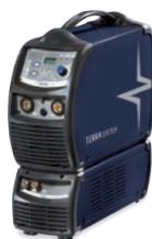
TERRA 270 TLH

270 A @ 45% 3x230 - 400 V 3 - 270 A 23,5 kg