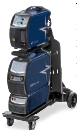
TERRA 500 MSE