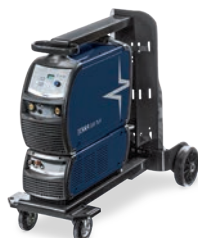
TERRA 320 TLH