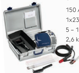
URANOS 1500 / 1500 RC