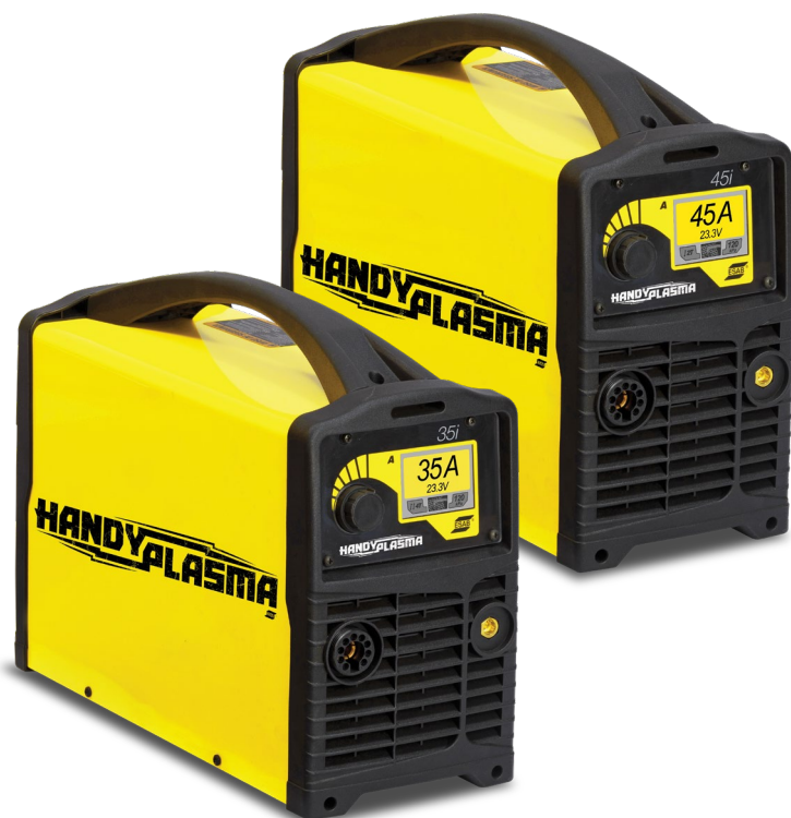
HandyPlasma 35i / 45i

Hand-held, light and portable power source for plasma cutting with a 220/ 230V 50/60Hz single phase power supply.