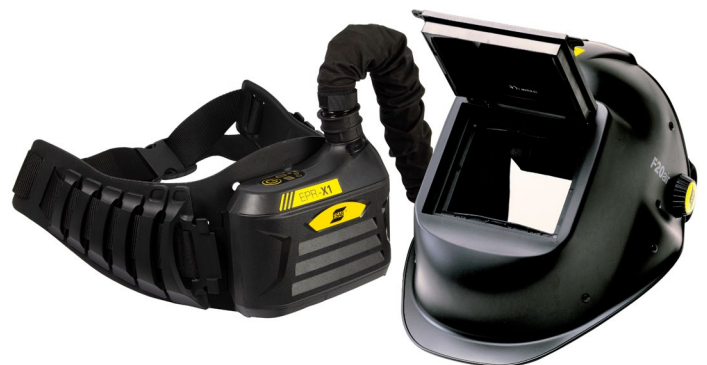
F20 Air with ESAB PAPR