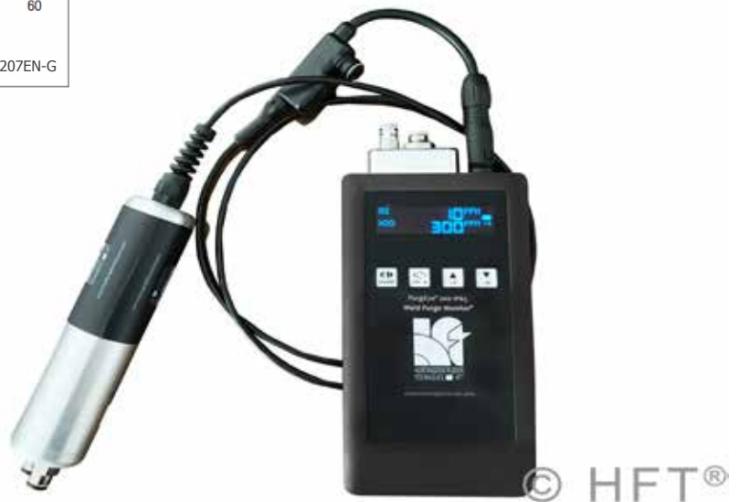
UNIT INSTALLED ON A PURGEYE® 200