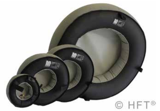
8", 10", 12" and 24" Low Profile Stopper