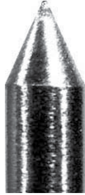
MultiStrike® Tungsten after 200+ welds