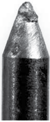
2% Thoriated Tungsten after 20 automatic welds