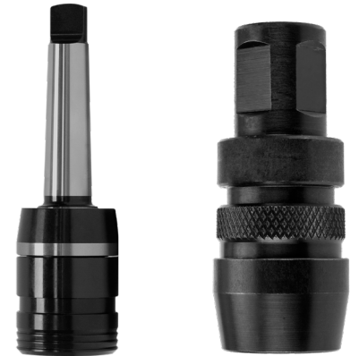
Supplied with two quick change adapters