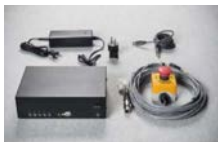
Electronic Control Unit and Cables