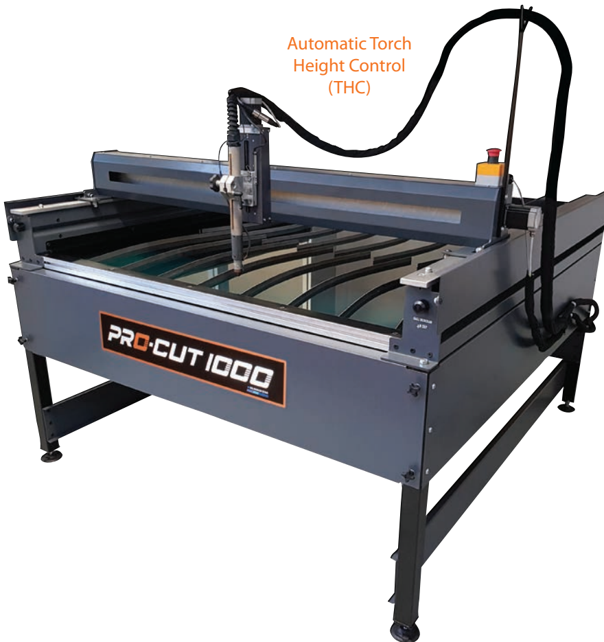
Automatic Torch Height Control (THC)

Our Torch Height Control system adjusts the torch height thousands of times per second to maintain a precise distance between the plasma torch tip and material being cut, ensuring on thinner material which are warped you will still experience smooth edges, sharp detail and precision cuts.