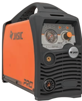
Jasic Plasma Cut 45

For optimum cutting performance, we have partnered the Pro-Cut Table with the Jasic Inverter Plasma Cutting Machines. We offer a choice of 3 Jasic Plasma cutters with a table cutting capacity of up to 20mm to ensure you get the right Plasma machine to suit your needs. With proven reliability, performance and backed up by a 5 year warranty we guarantee peace of mind cutting.