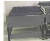
Extension Sheet Support (optional)