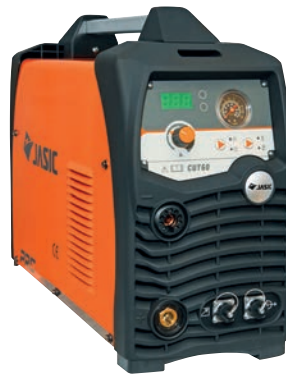
Jasic Plasma Cut 60