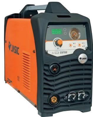
Jasic Plasma Cut 80