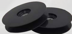
Dual Seal Purge Disc 140-155mm CP2033