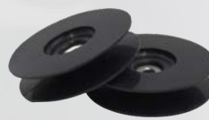
Dual Seal Purge Disc 87-100mm CP2030