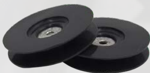
Dual Seal Purge Disc 120-135mm CP2032