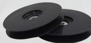
Dual Seal Purge Disc 150-165mm CP2034