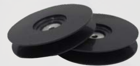
Dual Seal Purge Disc 101-110mm CP2031