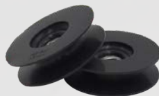
Dual Seal Purge Disc 75-86mm CP2029