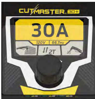
Simple and intuitive TFT LCD panel