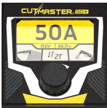
Simple and intuitive TFT LCD panel