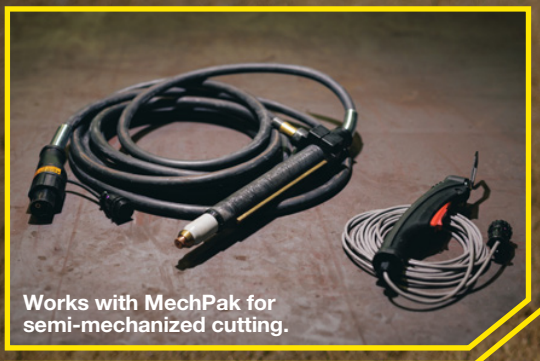
Works with MechPak for semi-mechanized cutting.