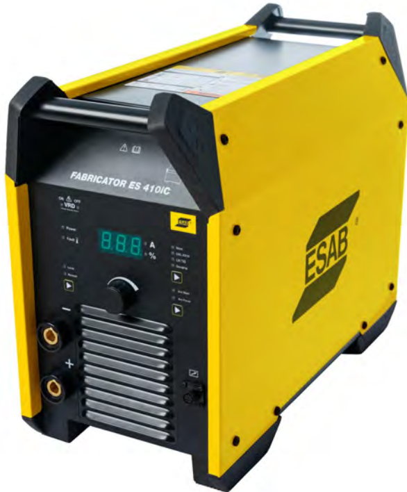
Fabricator ES 410iC

Fabricator ES 410iC is a heavy-duty inverter-controlled power source for MMA (Stick) welding, TIG (live-TIG) welding and CC Carbon-Air Arc Gouging.